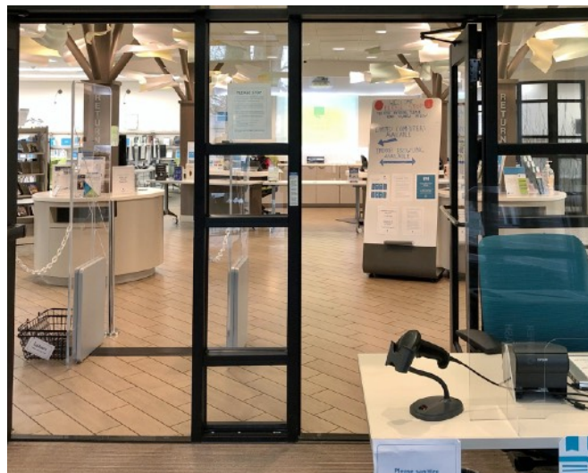
Our local Richland library is now open for Indoor browsing!