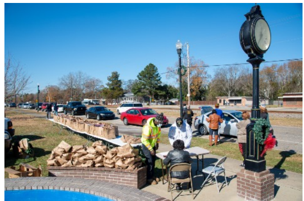
Drive-By Christmas Celebration and Giveaway getting started!