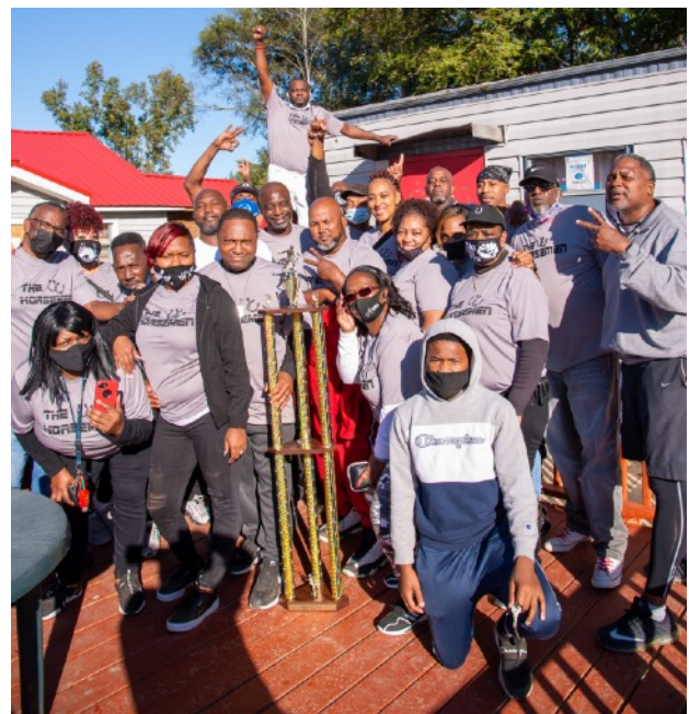
The Eastover Horseman defeated the Gadsden Regulators for their league's championship on October 17, 2020.