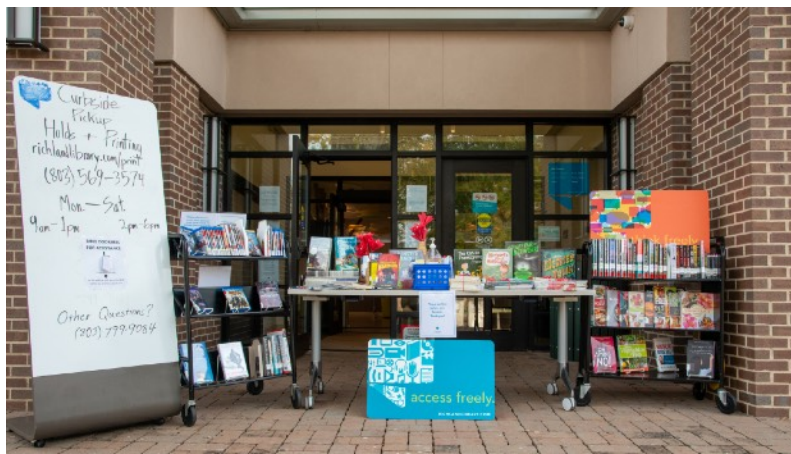
Richland Library Eastover curbside collection for browsing and checkout.